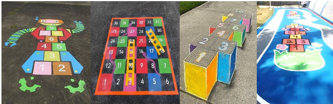
Figure 1 below illustrates the application of the traditional game-based floor mural concept when realized in a school environment. This concept is designed to integrate elements of visual art with traditional games, thus creating a learning space that is more interactive, educational, and culturally enriched.

Sumber: (Com Arte; Designs & Lines; Metalbac & Farbe; will Arte Graffiti: Pintura Artística De Brincadeiras Pedagógicas)